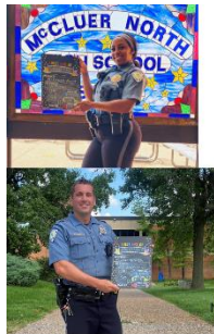
Welcome back Students! McCluer North High School Resource Officer's

The Florissant Police Department has formed a partnership with the Ferguson-Florissant School District which funds 75% of the costs of providing School Resource Officers (S.R.O.) for the academic school year. Starting in the 2019-2020 school year, the Ferguson-Florissant School District increased the amount of SRO's for their schools. This