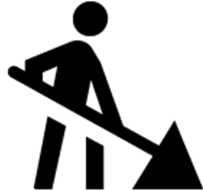
Updated Roadways & Sidewalks