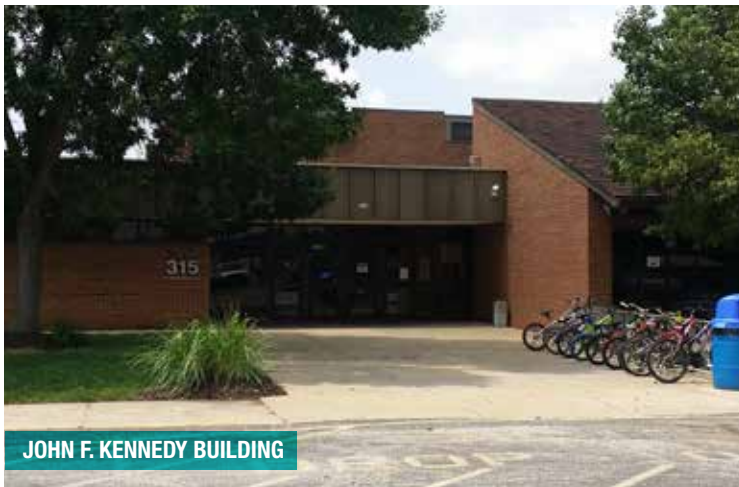
JOHN F. KENNEDY BUILDING

Children 12 years and younger must be accompanied by an adult (age 18 and older) at all times while in City of Florissant facilities unless otherwise noted. Anyone 17 years and younger will not be allowed in the city facilities during normal school hours when area schools are in session.