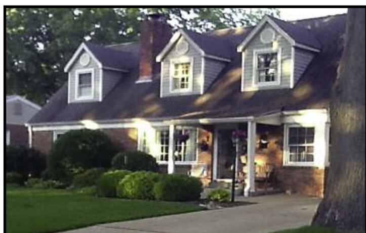
Ward 5 - Cleve & Carol Tegtmeyer - 4 Fountain Ct.